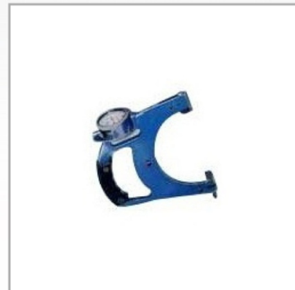
Precision Snap Gauges