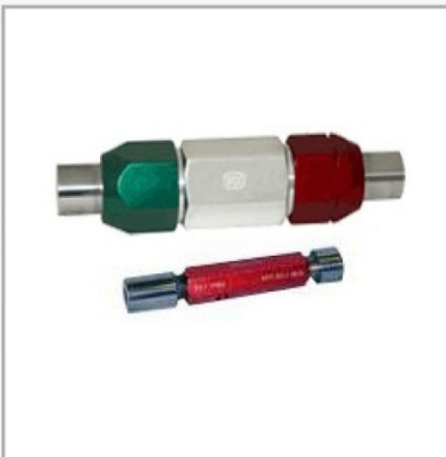
Thread Plug Gauges