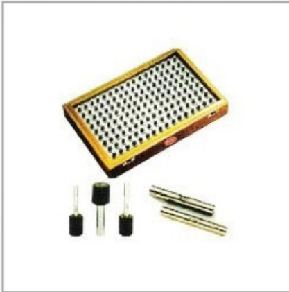
Steel Measuring Pins