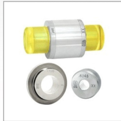
Industrial Setting Master